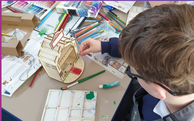
The students designed outdoor street furniture, public art, bird boxes and bug hotels for the competition